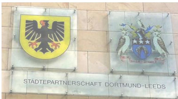
Dortmund – Leeds sign at Leeds Square in Dortmund