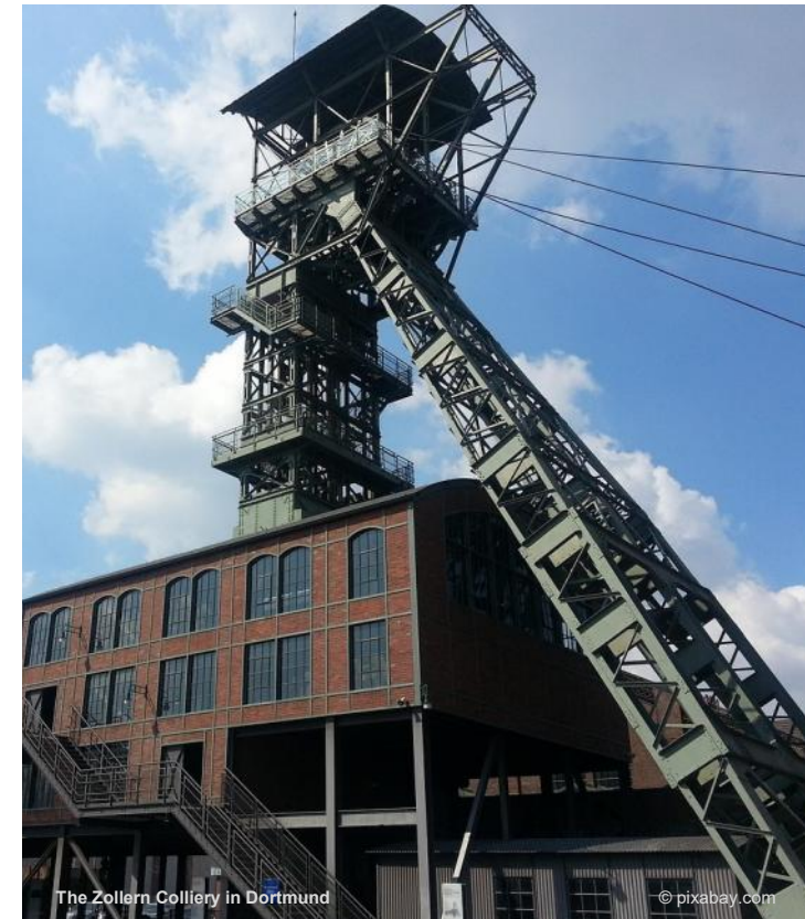
The Zollern Colliery in Dortmund