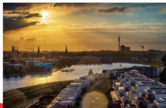
The Phoenix Lake